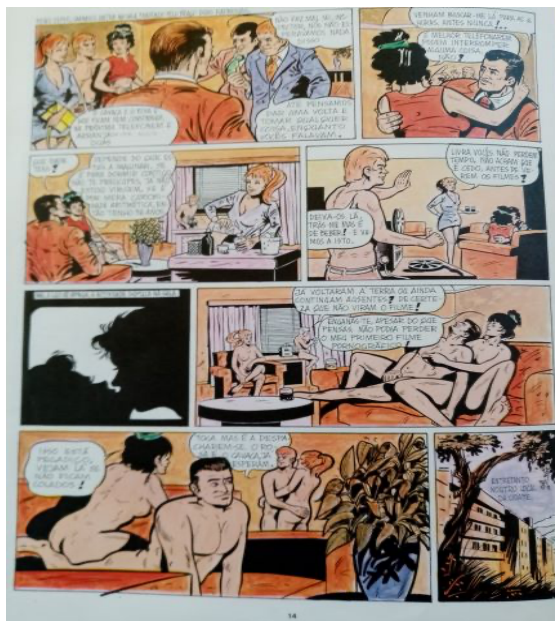
Figure 4: From Dossier PIDE/DGS. Na teia da PIDE (Edições Acropole 1975)

personal jealousies” as agents vied for a position within the PIDE’s “complicated bureaucracy and rigid hierarchy” ( Elementos para a história da PIDE 1976: 39). In Dossier PIDE/DGS , a widely-circulated comic-book series featuring the PIDE, 6 agents were shown resorting to the services of prostitutes and depicted as regular consumers of pornography, thus highlighting their moral hypocrisy ( Dossier PIDE/DGS. Na teia da PIDE 1975: 14).