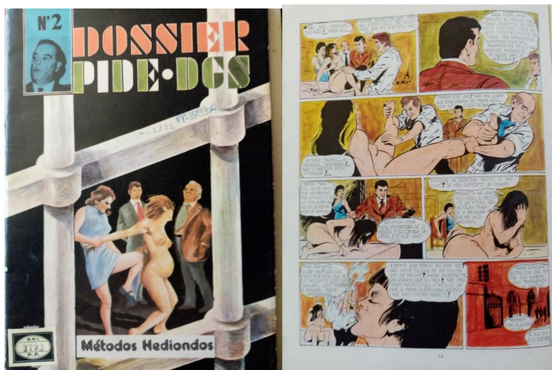
Figures 5 and 6: From Dossier PIDE/DGS. Métodos Hediondos (Edições Acropole 1975)