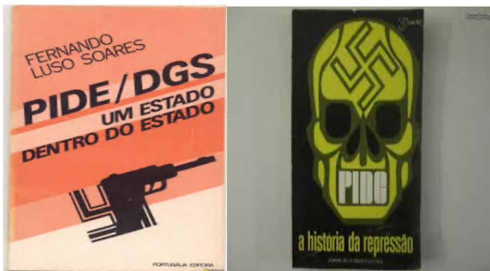
Figures 2 and 3: The iconography used in the books published during the April revolution actively associated the PIDE with its Nazi counterpart

Also, in Gestapo style, the PIDE was presented as omnipresent and omniscient. Its panoptic quality stemmed from its network of informers, those “men and women” acting as the “eyes and ears of Portuguese fascism” (Vasco 1977: 39). One publication estimated that, since its creation in 1945, some 200,000 “collaborators” had been involved in the PIDE’s activities, most of them informers (Manuel, Carapinha, and Neves 1974: 7). The PIDE had effectively “cast its net of informers throughout the country” ( Elementos para a história da PIDE 1976: 3). Based on fragmentary archival evidence, impressionistic generalizations were made as to their motives, systematically presented as base and immoral. While some informers were “blackmailed” into the role (Vasco 1977: 49), most assumed the position for material gain. They reported on their fellow citizens in exchange for “some favor” bestowed by the PIDE (Vasco 1977: 39) or “for a few miserable escudos” (Manuel, Carapinha, and Neves 1974: 7). That some informers reported to the PIDE out of genuine support for the regime was rarely recognized. When it was, it was invariably in deprecating terms. In the words of Nuno Vasco, they acted “out of their sick devotion to the totalitarian regime” (Vasco 1977: 39).