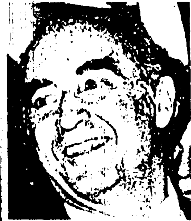
Jose Lopez Portillo