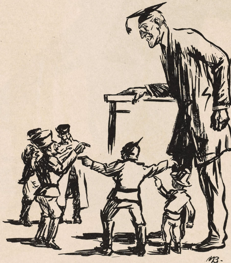
Drawn by Maurice Becker

This should be borne in mind in reading tales of the barbarous atrocity of soldiers, now on one side and now on the other.