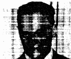
Vice President Rademaker

An unknown factor in the administration is Vice President Rademaker, a controversial retired admiral who made many enemies during his naval career. A staunch conservative, Rademaker helped plan the "revolution" against Goulart, and subsequently had an important part in purging subversive elements from the service. As Costa e Silva's navy minister, he became the senior member of the triumvirate that ruled in Costa e Silva's name following his incapacitation. Rademaker reportedly rejected the vice presidency at least twice, and accepted it only at