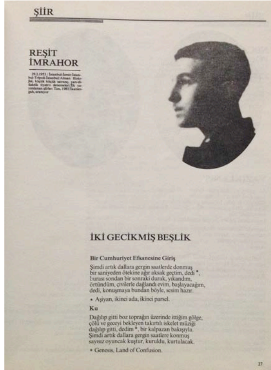
Fig. 1. Pessoa's picture in the 15 th issue of the journal Gergedan (1988, p. 27)

And here is the accidental quality: five years before the name Fernando Pessoa and one of the heteronymous works made their debut in Turkish letters, a piece of photograph taken in Pessoa's adolescent days showed up in an influential literary journal called Gergedan ('Rhinoceros') in 1988 (Fig. 1).