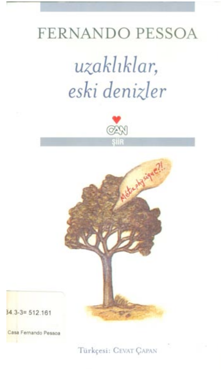
Fig. 5. The cover of uzaklıklar, eski denizler ['distances, old seas'] (2009)

Besides Çapan's endeavors to deliver the poetic complexities of the author in Turkish as completely as possible, Adnan Özer and Rüstem Aslan's edited volume published in 2000, Fernando Pessoa: 20. Yüzyılın Yalnızı (' Fernando Pessoa: The Desolate Man of the 20 th Century '), requires special mention (PESSOA, 2000): Özer, a well-known poet who has translated the works of great bards of the Spanish language like Lorca and Paz, and Aslan, whose language of reference is German, put together a list of works among which there are biographical notes for some of the heteronyms, translations from their works and short essays written by various literary critics on Pessoa's projects. The book also contains the translation of Marina Tavares Dias' guidebook to the city of Lisbon as it was during Pessoa's lifetime, supplemented with a detailed photobiography (PESSOA, 2000: 153-181). 9 Such resourcefulness in terms of the utilization of visual material strikes attention in another edited volume published in 2004 as a bilingual catalogue of a special