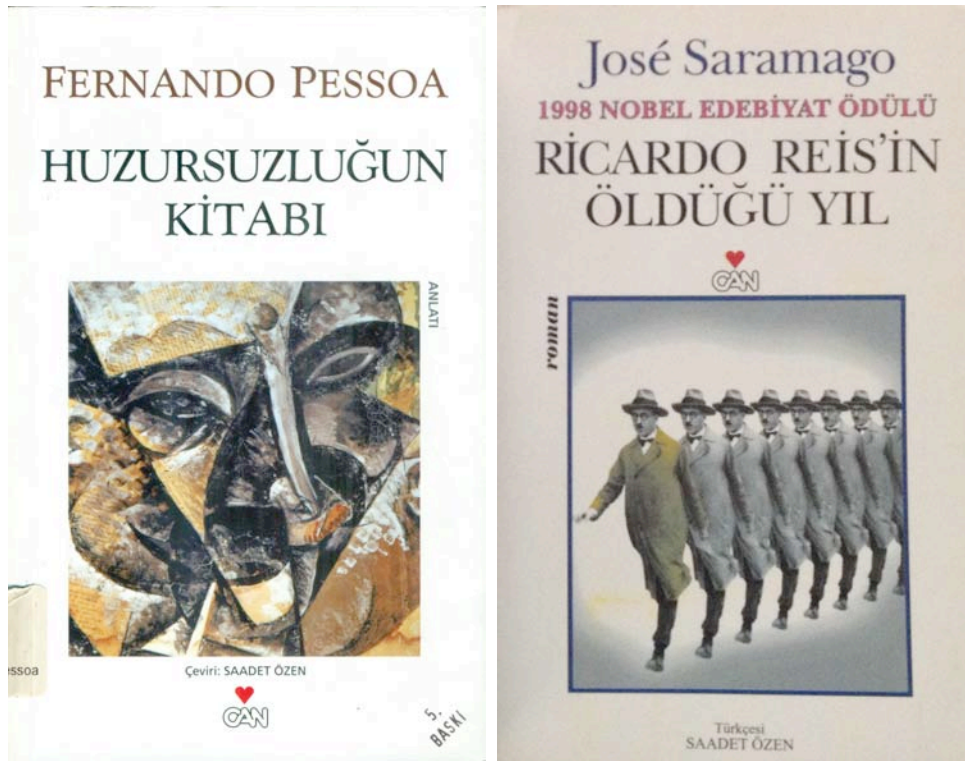
Figs. 6 & 7. Covers of Huzursuzluğun Kitabı [' Livro do Desassossego '] (2006) and of Saramago's Ricardo Reis'in Öldüğü Yıl [' O Ano da Morte de Ricardo Reis '] (2003)