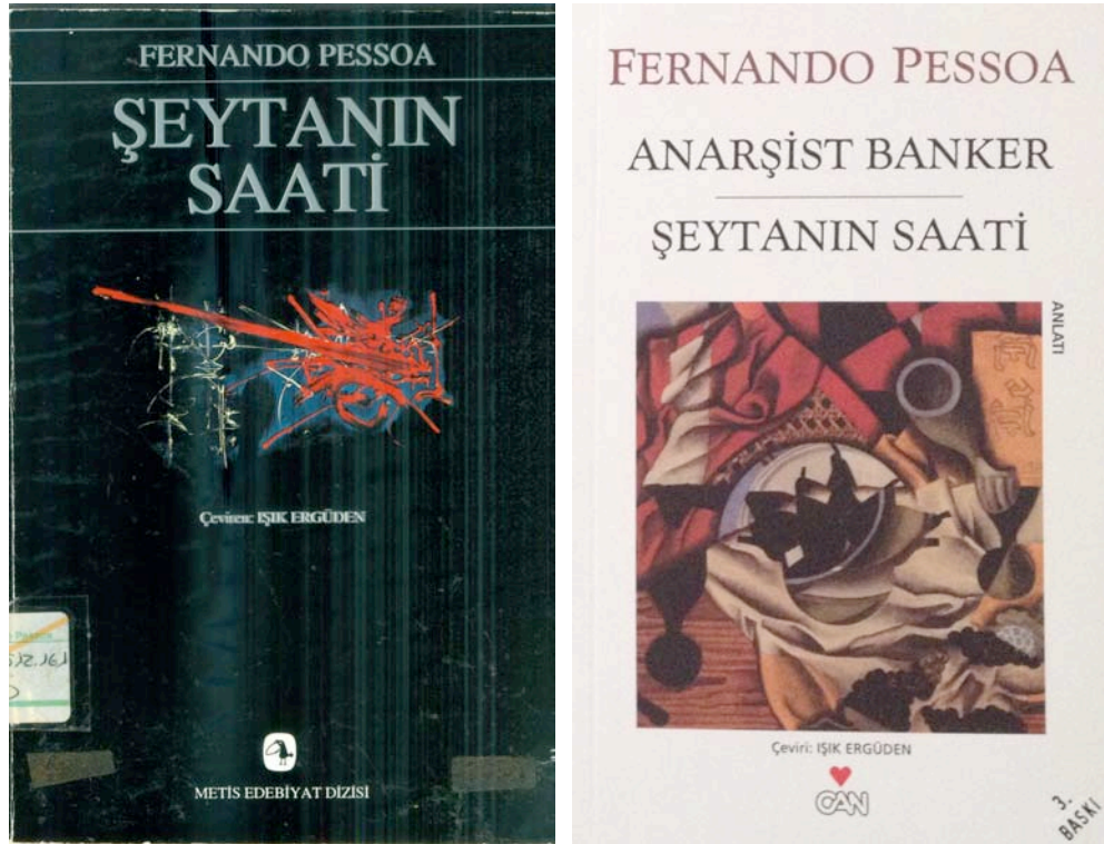
Fig. 2 & 3. Covers of the first edition of Şeytanın Saati [ A Hora do Diabo ] (1993) and of its last available edition, published jointly with the translation of O Banqueiro Anarquista [ Anarşist Banker ] (2006)

translated it in 1989 and 1990 only to see it published in 1993 as Şeytanın Saati by Metis Yayınları following his release from the prison (PESSOA, 1993b; Fig. 2). 5