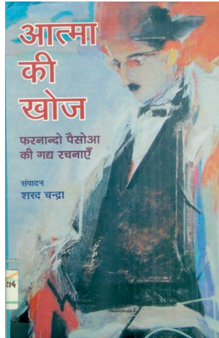
Fig. 2. Atma ki khoj [‘Search for soul’] (2005)

Fernando Pessoa's works, Atma ki khoj and Ek bechain ka roznamcha , which came out in 2005 and 2007, respectively. In the latter, this grave mistake is compounded by an even greater one, for she states that Pessoa was born in 1890. Returning to the first book, there is another important error, one of omission. In 1996, Pessoa's work once more came under copyright and remained so until 2005. But there is no mention in the book whether permission was sought from Pessoa's heirs for translating his works. In spite of all its shortcomings, on the whole, Fernando Pessoa ki kavitaen is a very laudable effort, in that it is the first—and until now the only—effort in India, outside Goa, 7 to present Fernando Pessoa's poetry to Indian readers in an anthology.