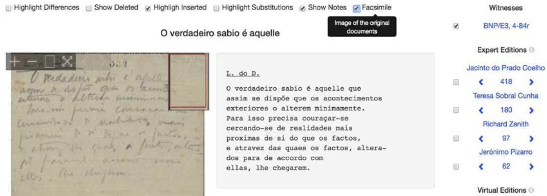
Fig. 3. LdoD Document BNP/E3, 4-84r.

shot, so we may compare all versions—original documents and publications by Pessoa, as well as posthumous editions.