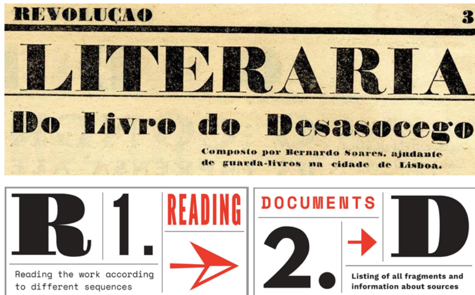
Figs. 6 to 8. Fragment published in Revolução (n.º 74.1) and homepage of LdoD (details).

It is hard to find things to criticize in a critique of LdoD , as we are still trying to grasp the new editorial horizon it reveals. Even the website aesthetics is thoughtful and groundbreaking, drawing inspiration from typefaces used during Pessoa's lifetime—as becomes clear if one juxtaposes a fragment of the Book of Disquiet published in 1932 and the fonts used in LdoD 's homepage: note how the capital "R" and "D" from the publication reappear in the website.