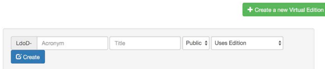
Fig. 4. LdoD “Virtual” option: create your own edition.

By providing enough freedom to design their own reading experience, LdoD wills users to become virtual editors. Reader autonomy is reinforced both by the “Search” section (supporting simple or advanced queries based on editions, dates, or keywords, among other criteria), and by the “Virtual” function. The latter stands as one of the most advantageous features of online platforms and perhaps the ultimate contribution of this project: openness to user response (Fig. 4). Through “Virtual,” users are able to create their own editions of the Book of Disquiet , by curating fragments based on any criteria and from any of the prior editions featured. Thus, the platform's openness to users mirrors the way it invites us to read the paper editions, and by doing so, LdoD is highly coherent: it abides to the same standard of mutability that governs its arrangement of previous editions. Ultimately, the website dismantles our “anxiety for unity,” a term conceived by Jerónimo Pizarro, who has advocated for representing the multiplicity and fragmentation of the creative process (PIZARRO, 2016: 288) b . As LdoD manages to prove, the acknowledgment of the author as only one of the entities responsible for the text does facilitate a fruitful reading experience.