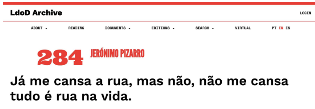
Fig. 1. LdoD homepage, detail with random quote.

Any description of the navigation experience of LdoD —or at least one that intends to be coherent with the way the project conceives itself—inevitably pays heed to two features made prominent in the website: mutability and immersion. By the former we refer to the site’s ongoing recreation of a sense of uniqueness and infinitude, that is, of the impression that no two navigation experiences will ever be the same. This is evident right from the start: the homepage (composed of a brief description of the project followed by links to the site’s five main sections: “Reading,” “Documents,” “Editions,” “Search,” and “Virtual”) is introduced by a random quote, from the Book of Disquiet , that changes every time the site is refreshed or re-entered (Fig. 1). This rotating quote not only makes room for literary interpretation, as a common epigraph would, but also is accompanied by a link to the entire fragment where it is originally found. This means that the first and most visible link users encounter is one which immediately takes them to the gist of the site: any random fragment that inevitably blurs the notion of a starting point. Thus, by entering the site, users are only one click away from finding themselves amongst the labyrinthine abundance of the Book of Disquiet .